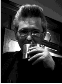
Have a Safe Trip Home

XXXXXXXXXXXXXXXXXXXXXXXXXXXXXXXXXXXXXXXXXXXXXXXXXXXXXXXXXXXXXXXXXXXXXXXXXXXXXXXXXXXXXXXXXXXXXXXXXXXXXXXXXXXXXXXXXXXX