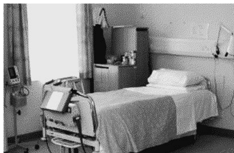
Hospital Bed similar to the one occupied by the General Secretary