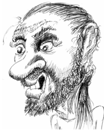
Geese yer dosh yer bastards

Anyway, well done for staying the course once more. It must be good to know that about you the trouble of calling meetings and writing circulars to justify your paid seaside holiday,